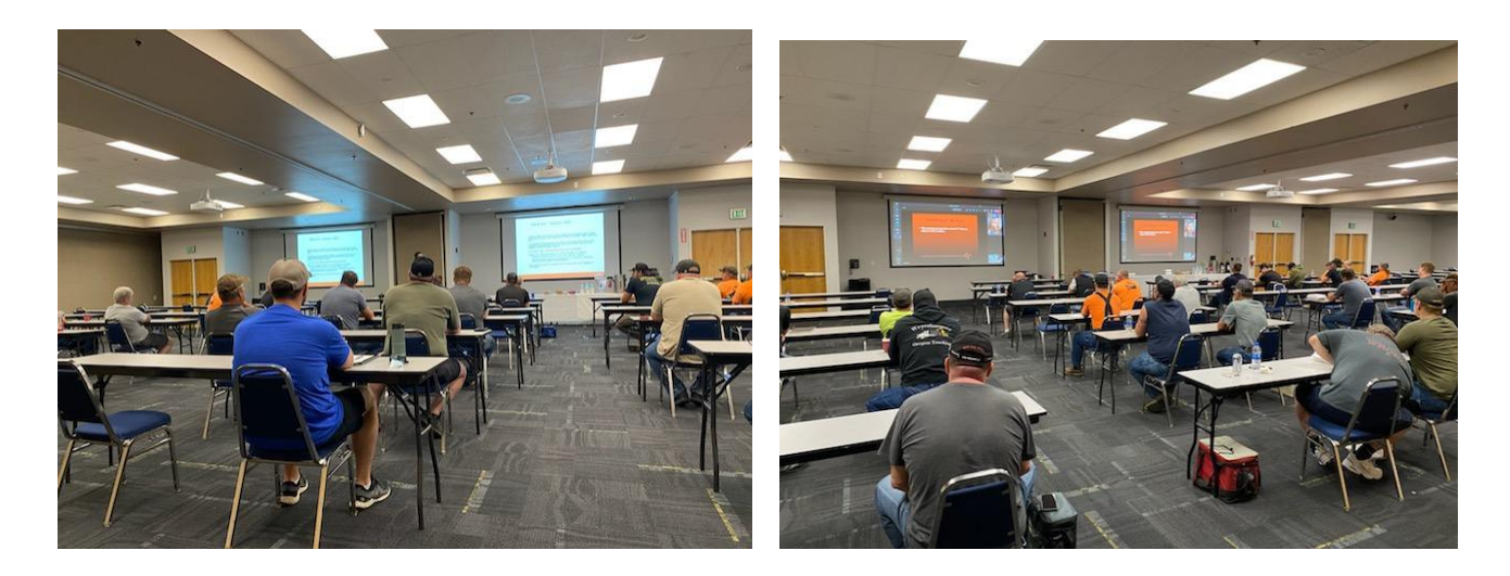
Roseburg Class – June 22<sup>nd</sup> and 23<sup>rd</sup> – 61 Attendees