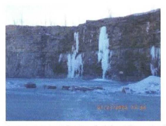
A miner was severely injured while working near the base of an approximate 65 ft. highwall. The miner was struck by loose, fractured and overhanging rocks.