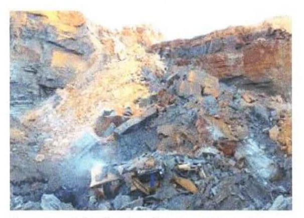
A miner was fatally injured at a surface coal mine while operating a front-end loader to remove shot rock near the base of a 63 ft. highwall.

Since CY 2012, falling rocks and materials from hazardous highwalls have resulted in 9 mining fatalities and 27 serious injuries.