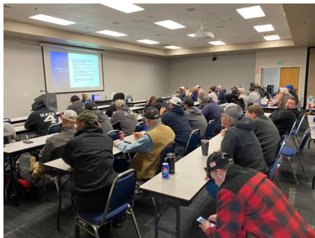
Albany class photos