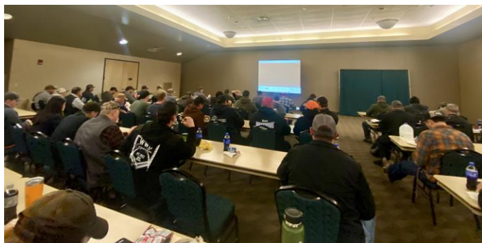
Roseburg class photos