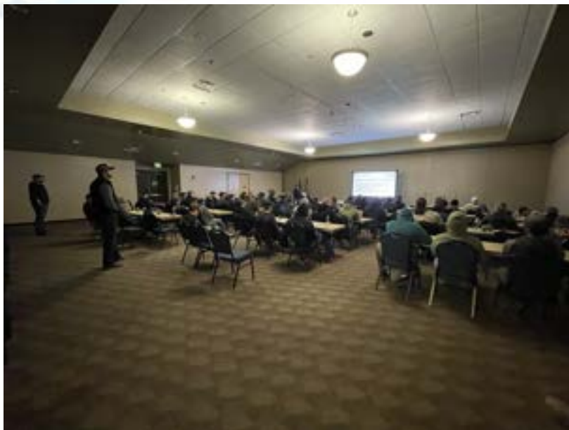
Photo 1: Roseburg Part 46 Training at the Douglas County Fairgrounds

Thank you to everyone who showed up, stayed engaged, and helped make the sessions worthwhile.